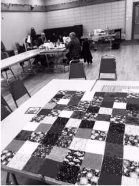
The black and white of designing a quilt top !